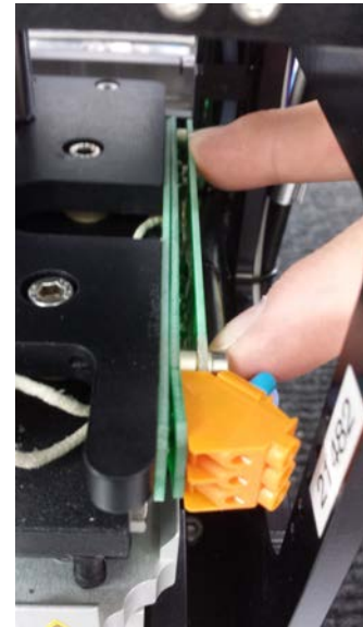
Heater Termination block